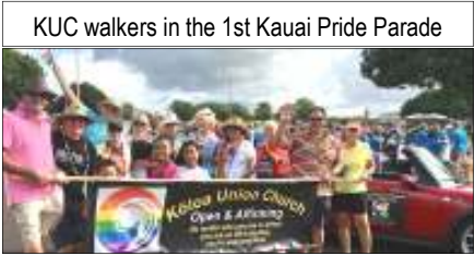
KUC walkers in the 1st Kauai Pride Parade