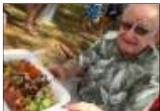
Becky's Dad enjoying lunch