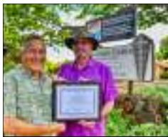
Officially an ONA church in the United Church of Christ