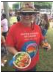
Kahu enjoying lunch—"rain-bowl" from Kauai Poke!!