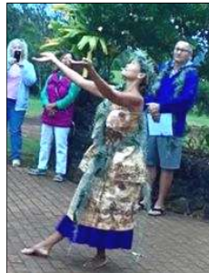
Easter sunrise service.